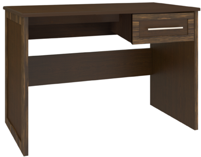
Model: TEDK102R 45.25W 19.5D 30H

Contemporary Tempe Collection is stunning storage featuring dual-tone finishes and an overlay door and drawer design. The premium, oversized, steel hardware offers contemporary styling and easy-to-grab functionality and the dual-tones make this collection perfect for memory care giving the resident a visual boost.