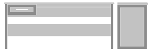
TEDK103L 69W 19.5D 30H