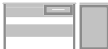
TEDK102R 45.25W 19.5D 30H