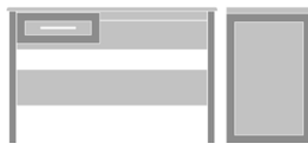
TEDK102L 45.25W 19.5D 30H