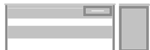
TEDK103R 69W 19.5D 30H